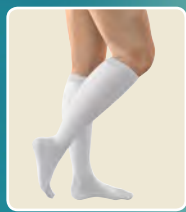
White Below Knee