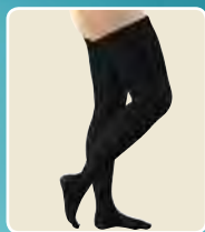
Black Thigh Length