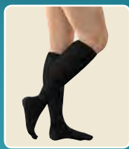
Black Below Knee

Class-leading comfort supports long-term use