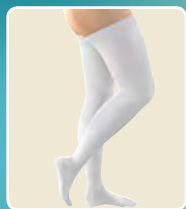
White Thigh Length